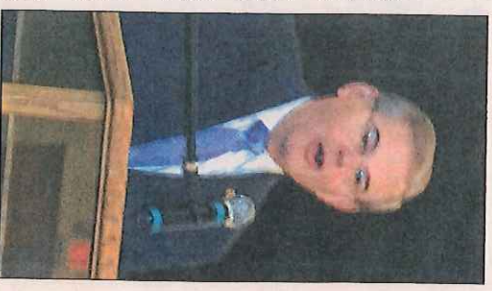
Speakers at the Black History Month event included U.S. Sen. Robert Menendez.